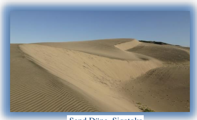
Sand Düne, Sigatoka

Gecko's Resort houses also a museum about Fijian culture. It is split over several bures made of palm leaves, and that's where we got some more insight about cannibalism. Nowadays, it's believed that missionaries often exaggerated about of the numbers of humans being eaten, just to put their own activity into a better light. In any case, on almost all Pacific islands, the number of people who died of disease brought in by the white man, exceeded by far the number of those being eaten by cannibals! On several, if not most islands, some 90% of the population died within a few years after contact with the white man, as they weren't immune to European disease. Some more islanders died through typhus, caused by wearing wet clothes, after the missionaries convinced them that it's now a sin, to live and bathe naked.