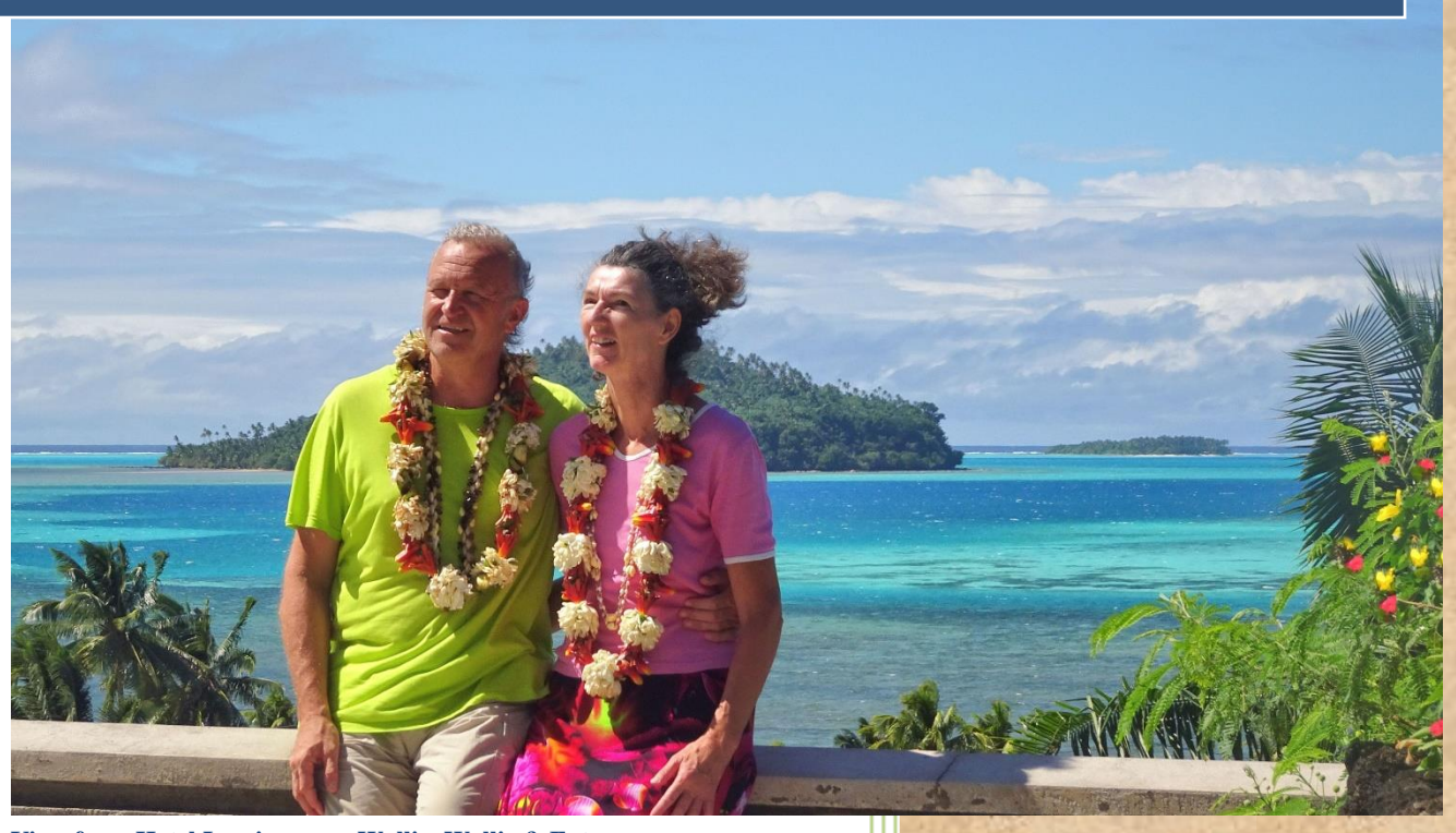
View from Hotel Lomipeau on Wallis; Wallis & Futuna

South-Pacific: unique islands and cultures